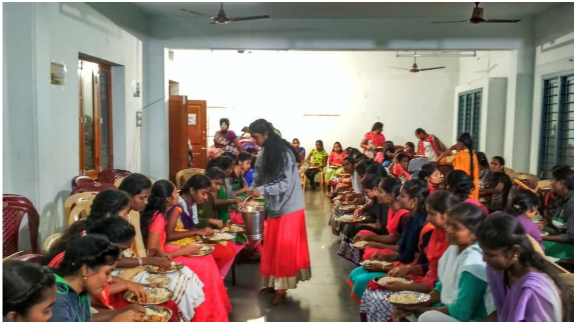
Lunch arranged by Lady Hope Alumni Association