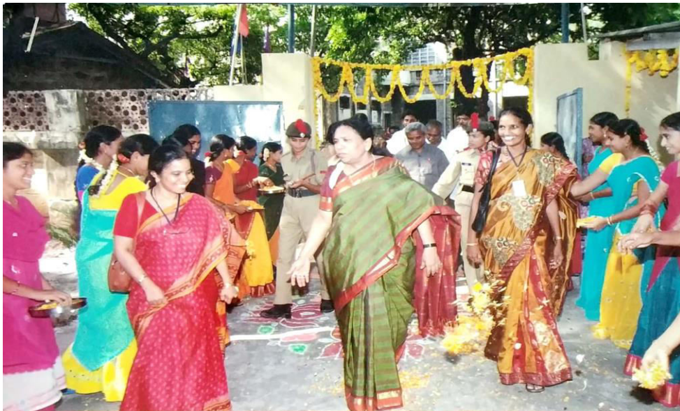
Inviting the guest by students