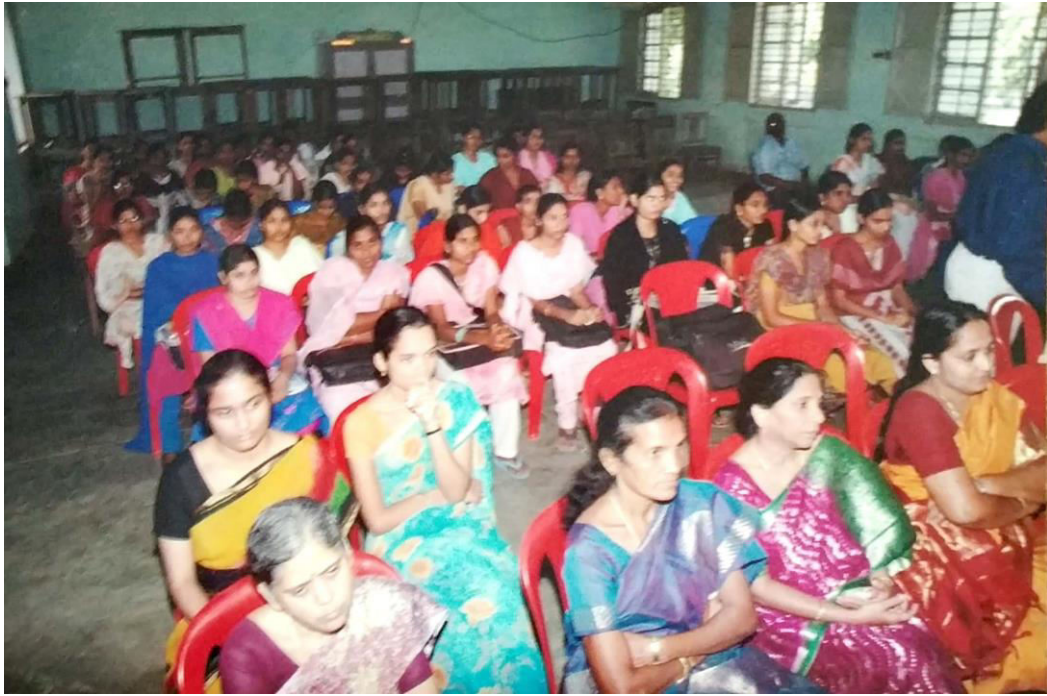
Alumni attended for the meeting